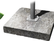
(SM) Surface Mount