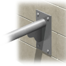
(WM) Wall Mount